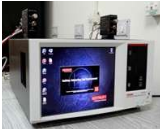
Keithley 4200-SCS Parameter Analyzer