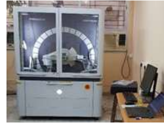
Panalytical Empyrean XRD