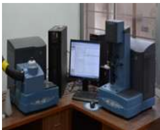
DSC and TGA