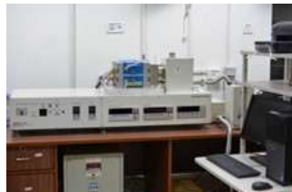
Seebeck Coefficient Measurement